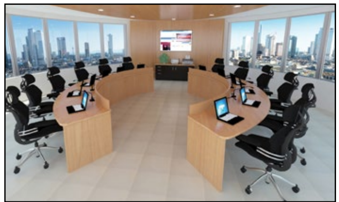
Custom control room consoles designed to your exact specifications.

If you're looking for a workplace as unique as the technical environment you work in, look to Winsted. We understand that in complex technical environments like yours there are countless intricate details to consider. From the comfort of your operators, to the aesthetics of your space, our designers will work with you from initial concept to final installation. We will ensure that your solution is perfectly designed to meet your needs in both form and function. Winsted designers have the insight and experience to take your most complex control room from concept to reality.